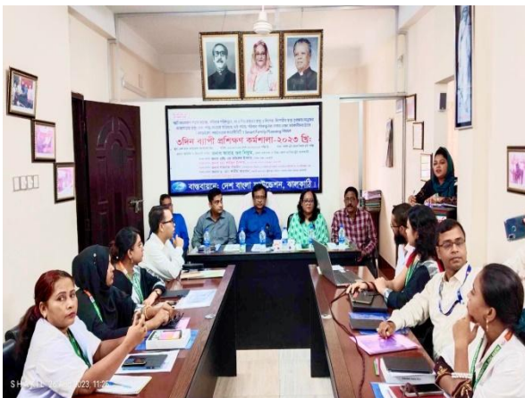
e-MIS software training's opening ceremony

Desh Bangla Foundation (DBF) conducted Three days e-MIS software training in an initiative to work in harmony with Jhalkathi Family Planning Department to build MIS software connectivity, and smart Bangladesh by purchasing the tab with DBF Chairman's own funding.