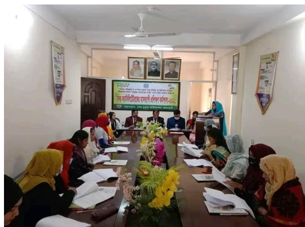
Midwifery Training: Midwifery Training, for 12 midwives closing and certificate/ equipment distribution by the Deputy Commissioner of Jhalkathi