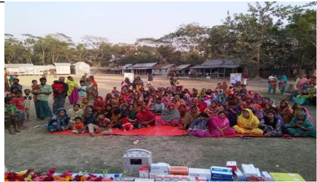
Family Planning Counselling under DBF FP Program in presence of District commissioner(DC) Jhalokati.