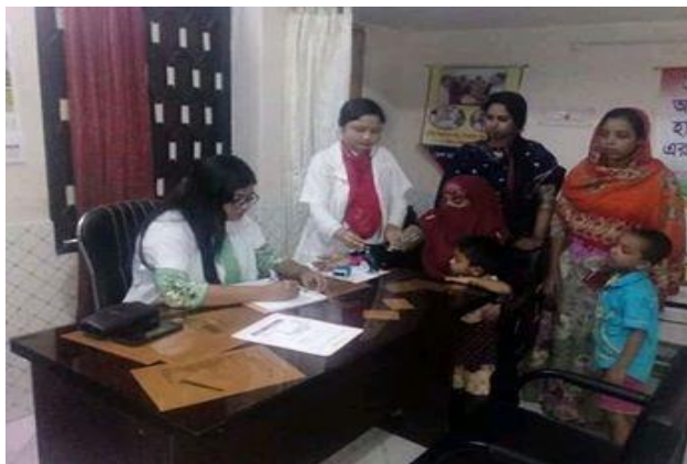
Free treatment of extreme poor