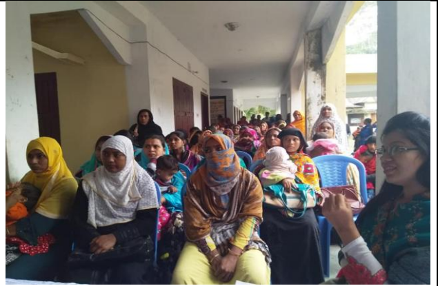
Massage dissemination among service seeker women of Jhalakathi district during maternity under poor and distressed mother allowance program