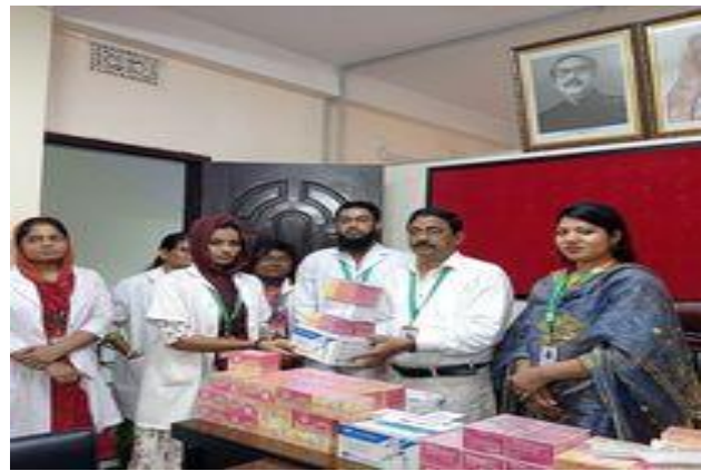
supply of necessary accessories of family planning among listed couple(8200)