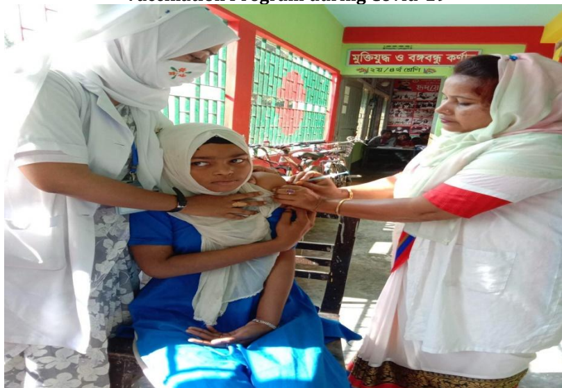
Providing Covid-19 Vaccine to school students