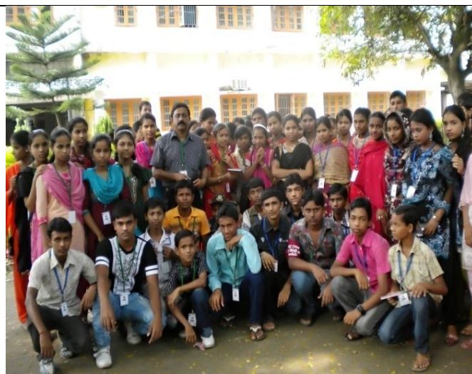
DBF Chairman with Adolescent boys & Girls

It is remarkable that these clubs are used not only the adolescents, but also their parents are involves with these club for developing adolescent group. To run this program smoothly, LGI & Line Ministers are engaged to monitor & follow-up the club activities according to GOB guidelines. Different awareness raising session are conducted to raise their voice and to empower them. life skill training are provided and then after enhance them to build professional relationship with different services providers to be self-reliance. After all to make them the resources in the society.