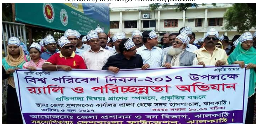
Rally on the Occasion of World Environment Day- 2017