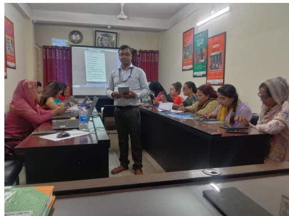
e-MIS software training's closing ceremony