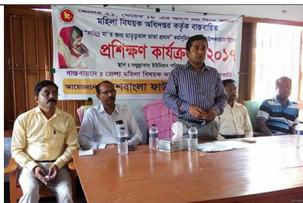
Reputed guest of district administration, social welfare, child and women affairs department in massage dissemination program.