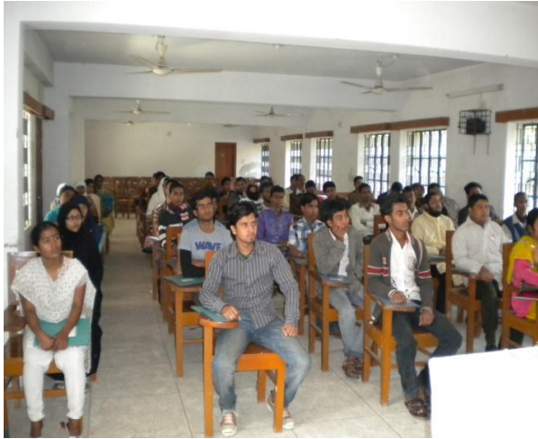
Life skill training session under DBF Networking for Youth Development program.

In future, DBF have a plan to take initiative for the youth group to make them self-reliance through providing different technical training especially Computer training, poultry and livestock, small entrepreneurship and other development issue. It is noted that we already received some of logistic assets from the Department of Youth Development of Jhalakathi.