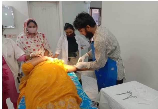
Provide Implant services