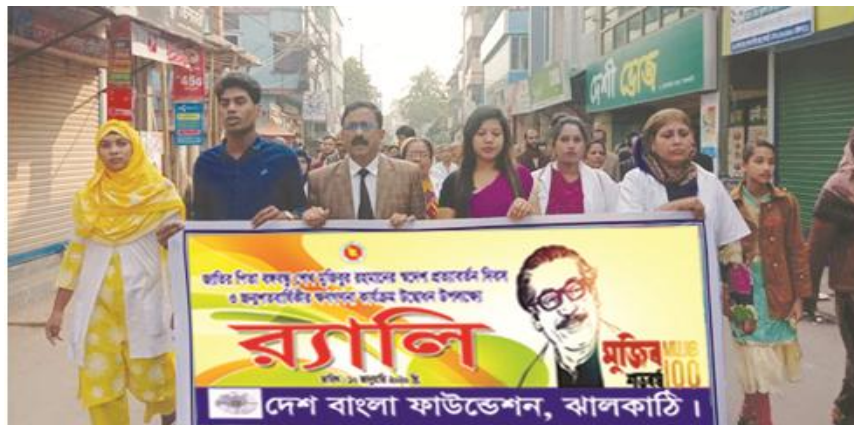
Participate in national event organized by GOB Department Attended by Desh Bangla Foundation, Jhalokathi

Desh Bangla Foundation works with different program relating with different government institution. DBF has successfully participated in rally, day observation and public gathering is likely to be addressed here.