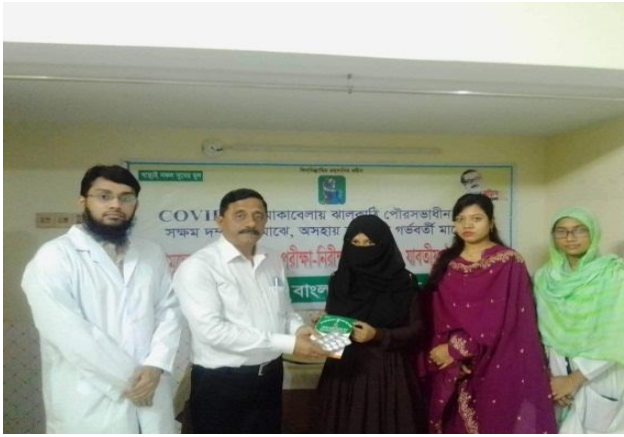
Distribution of medicines & vitamin supplements to pregnant mothers