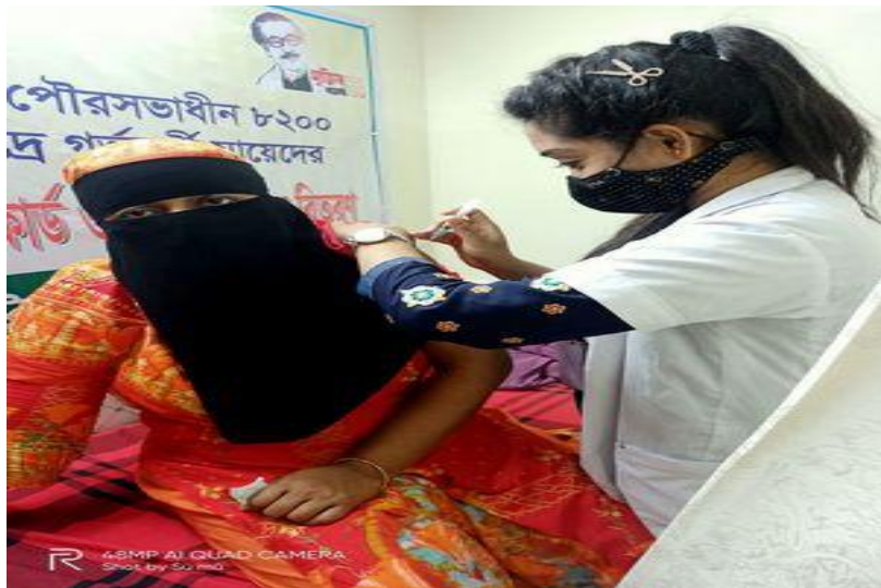
Vaccination Program during Covid-19

DBF has successfully arranged vaccination program on the 75 th Birth Day occasion of Honorable Prime Minister Sheikh Hasina in Jhalakati pourashava. DBF Hospital & family welfare center counted as a vaccination center with the affiliation of higher authority.